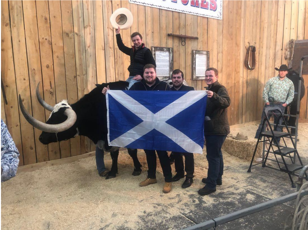
Pictured above: guests from Scotland enjoying the 2018 National Western Stock Show