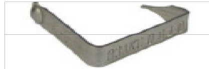
Visual and RFID 840 -tag